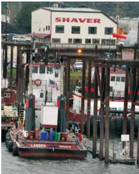
(Above) One of Shaver Transportation tugboats docked at their headquarters in Portland. (Right) Philip Stahl, a grower from Ritzville, in the control room at Columbia Grain Terminal also in Portland.