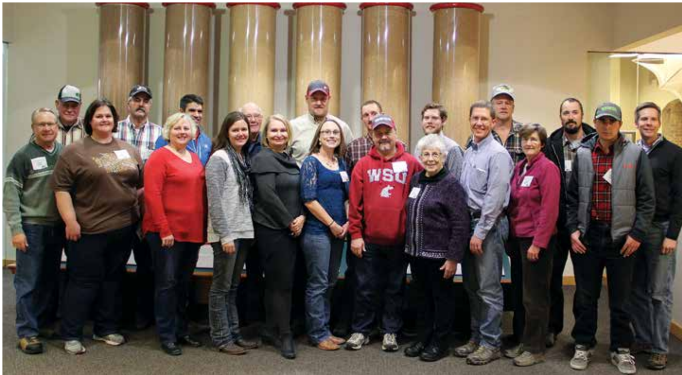
The 2015 participants of the Pacific Northwest Wheat Export and Wheat Quality Tour at the Wheat Marketing Center in Portland.